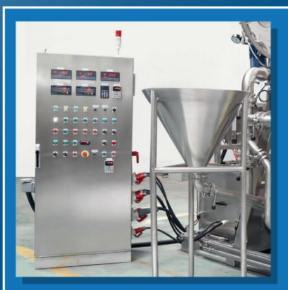
Pushbutton Electric Control of PVC Mixer