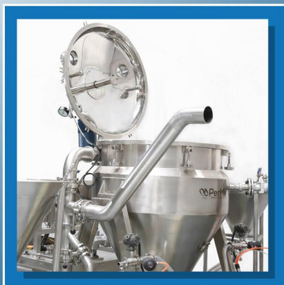
PVC Mixer with Open Cover