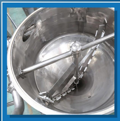
Inside Anchor Mixer of PVC-500 Mixer