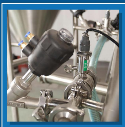
Flow Meter to Control Liquid Adding