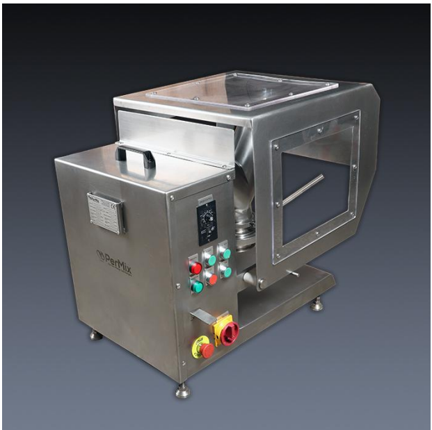
PVM-5 Mixer with Electric Control Panel