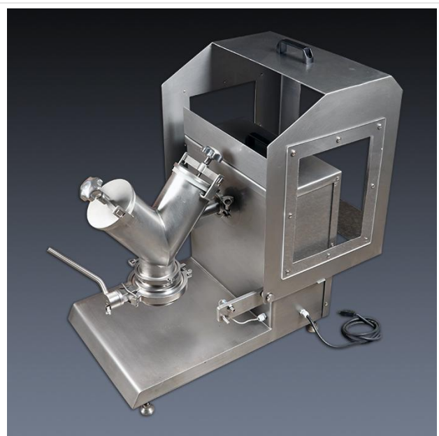
Lab-size PVM-5 Mixer