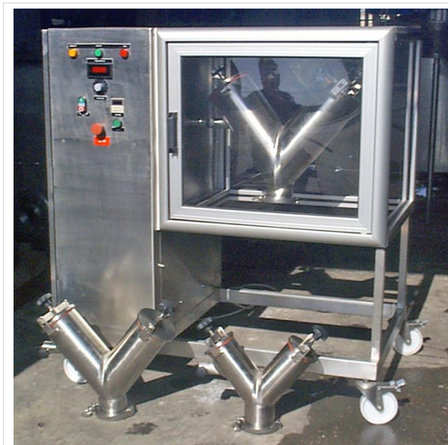
Special Design with Interchangeable Vessels