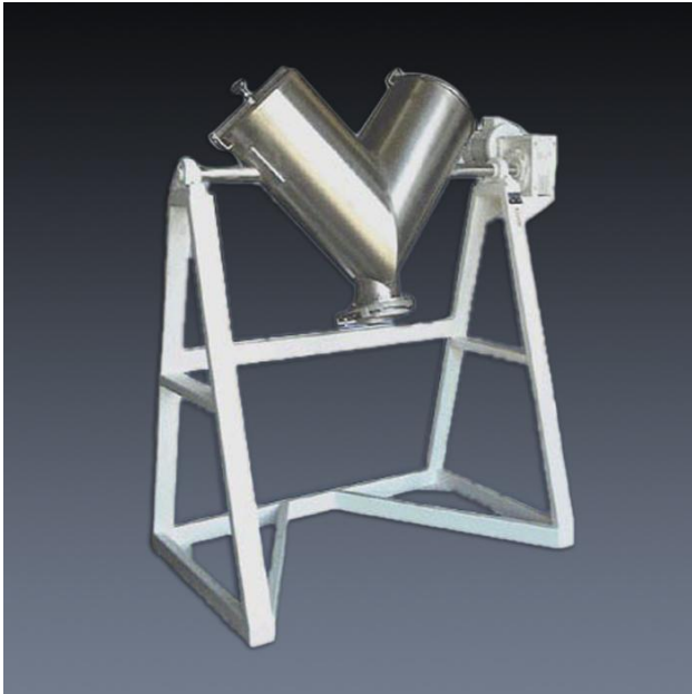
Standard PVM V-shaped Mixer