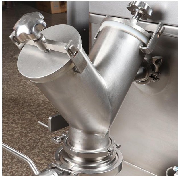
Vessel of PVM Mixer