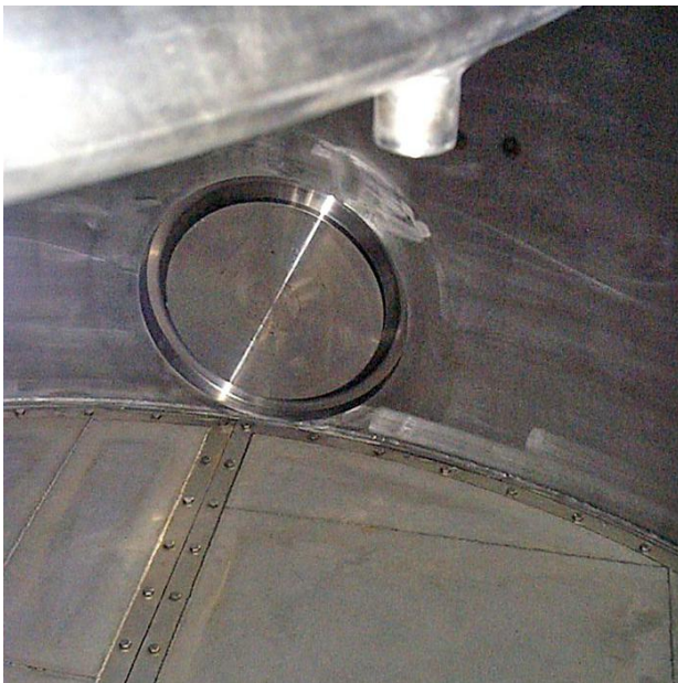
Discharge Valve of PNF Nutsche Filter