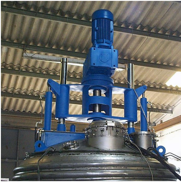
Drive System of PNF Nutsche Filter