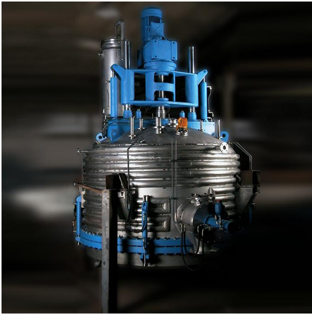
PNF Filter Dryer with Jacket