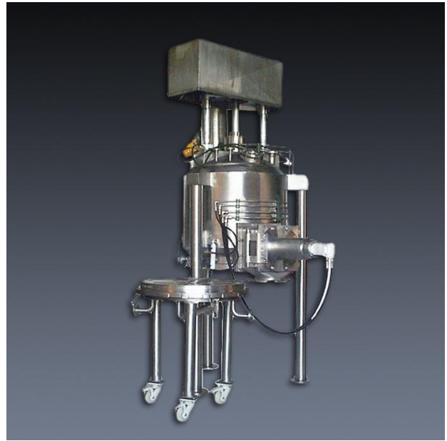
Filter Dryer in Stainless Steel for Pharma