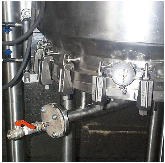
Fast Clamping System of Nutsche Filter Dryer