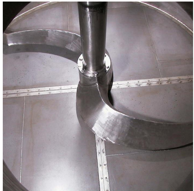
S-shaped Agitator of Nutsche Filter Dryer